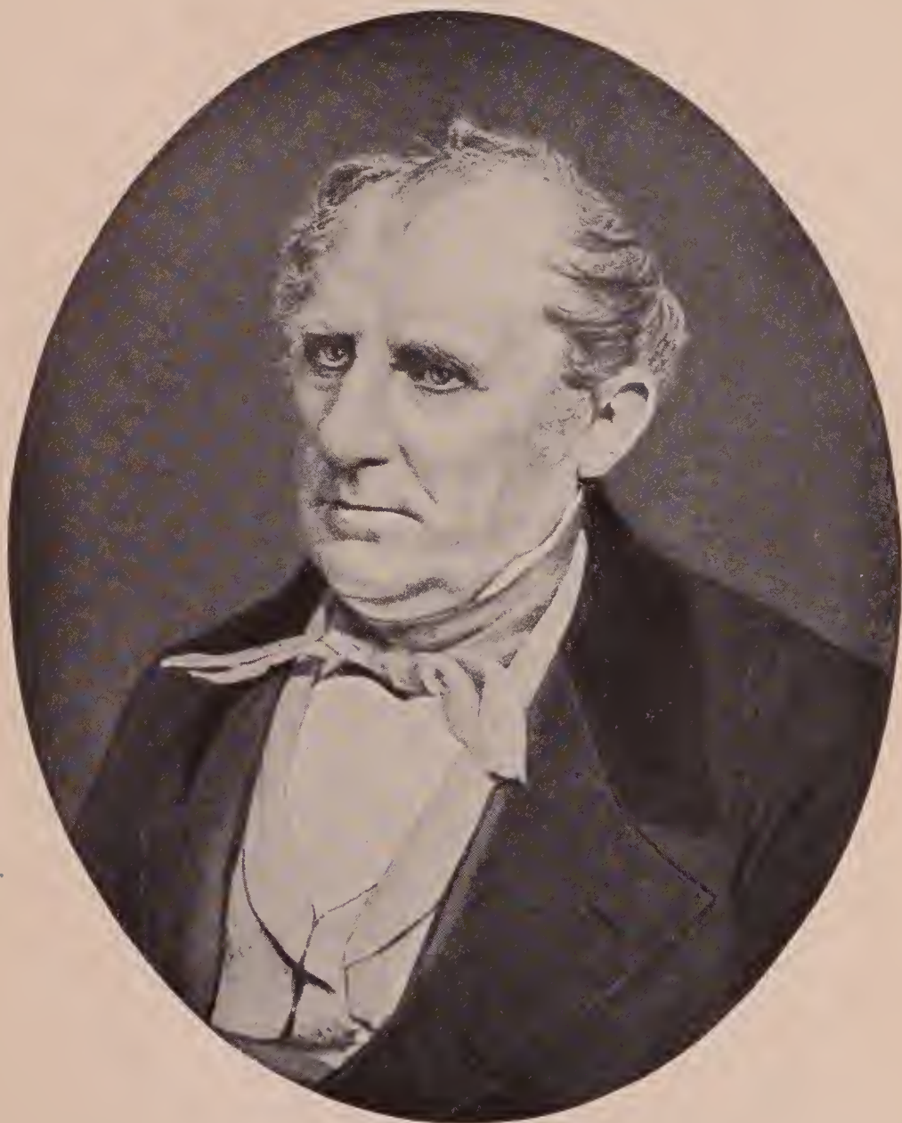
JAMES FENIMORE COOPER